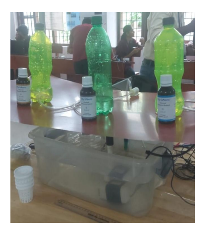
fig. 4: Nutrient Containers and Reservoir

The automated hydroponic system is set up as shown in Figure (4). A reservoir is attached to the bottom of the system where a pump facilitates the circulation of water. The required nutrients are added to this reservoir. Various sensors measure the parameters of the water and send these data to the firebase, using which we can view the changing parameters through the mobile application. The data obtained from the Arduino board is displayed through the LCD at the same time.