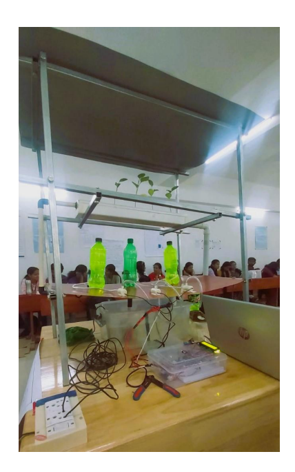
fig. 3: Setup of the Automated Hydroponics system.

As a part of implementing the system, the seedlings are raised in grow cubes before transferring them into the system. The plants are placed in pipes such that the roots come in contact with the flowing water.