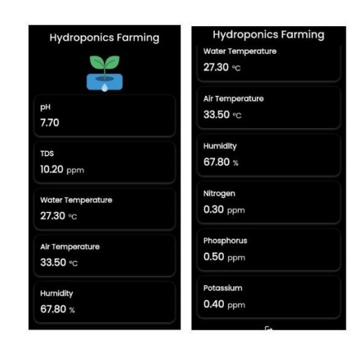
fig. 6: Reference values and obtained values of various parameters.

The given figure (5) is the UI of the web application developed for the real-time monitoring of vital parameters of the hydroponic system. Each user needs a unique user ID and password to log in.